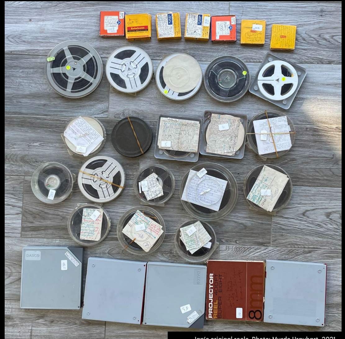
Ian's original reels.